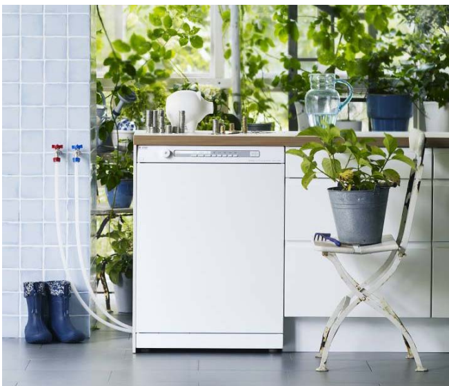
ASKO W6884 ECO washer

The ECO washer (W6884 ECO) has two water inlet connections instead of just one: one for hot and one for cold water. The machine automatically adjusts the amount of hot or cold water that needs to be added to achieve the correct temperature for your chosen program. When the water needs to be warmer than the incoming hot water the washer heats it to the chosen temperature. On a 140° F program you save as much as 25 minutes and 58 % of the washer’s electrical energy consumption.